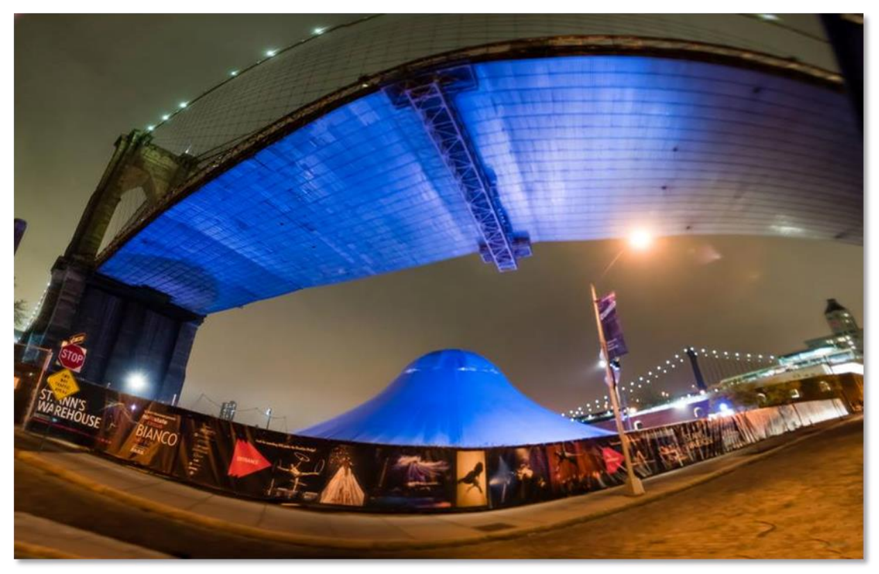
No Fit State's Big top under Brooklyn Bridge, New York. 2016

Non-public funding of the Arts An Inquiry by the National Assembly's Culture, Welsh Language and Communications Committee